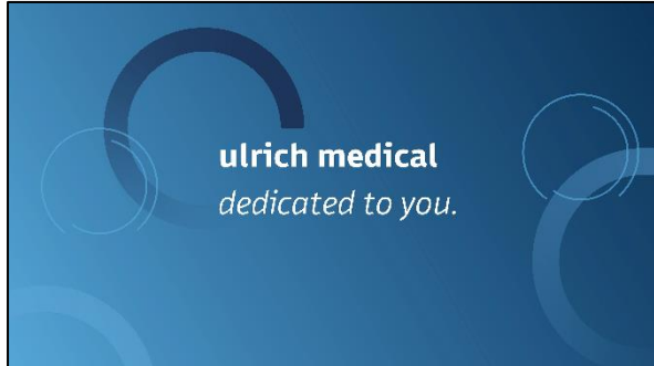
Bild 3: The corporate design of Ulrich Medical with the brand message "dedicated to you."