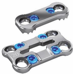
Image 1: Above, the 1-level midline plate, and below, the standard plate of the Artus cervical plate system.

(Screen resolution only! Request print resolution at ulrichmedical@pr-hoch-drei.de .)